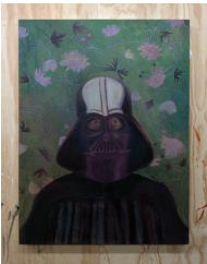
The Starlight Banquet Ballroom , 2026 Oil on canvas 38"x28"