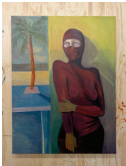
The Thief Haunts The District, 2026