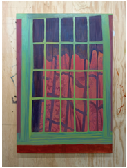
Window , 2026 Oil on linen 50"x36"