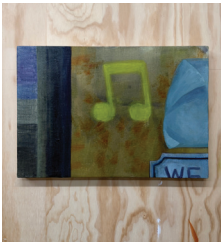
The Green Note Grill, 2026