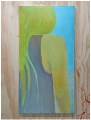
Parking Lot, 2026