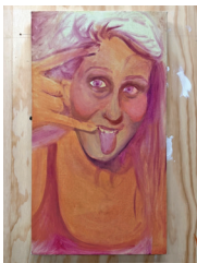
Fun Tonight , 2026 Oil on linen 20"x11.5"