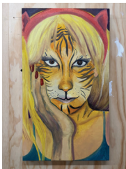
Jessica , 2026 Oil on linen 20"x12"