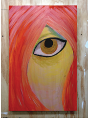
Disco Night at Green Note Grill, 2026