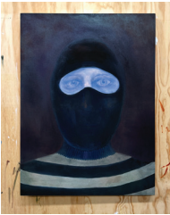
So Alone , 2026 Oil on canvas 38"x28"